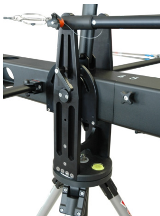
Crane support stand incl. spirit-level