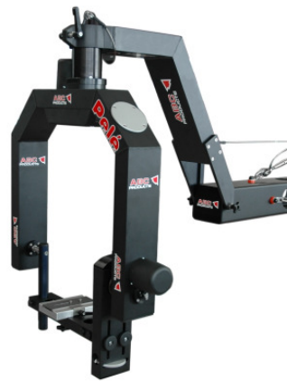
Crane-head with (optional) Remote-Head

Filming at a big sport event (i.e. Soccer World Cup), in the Himalayas, on the roof of a skyscraper in New York or on a South Sea Island beach, wherever the use of a camera crane is necessary: the ABC-Light Cranes are easy to transport, uncomplicated, within minutes ready to use and enable fantastic shooting wherever you are.